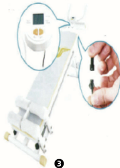
③ Fix the counter and connect the cable