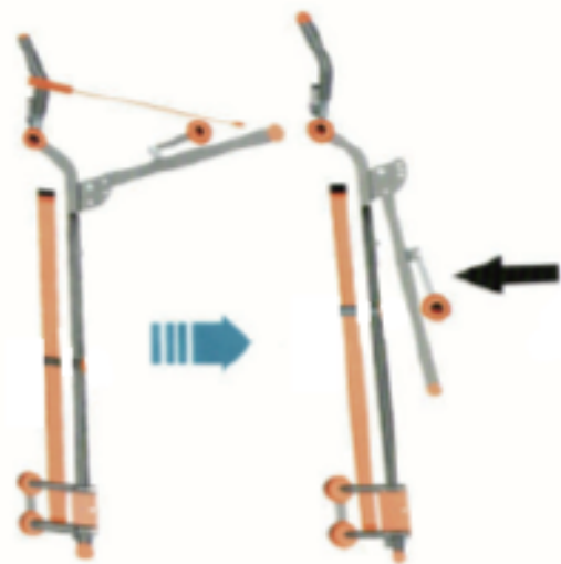
④ Fold and stock